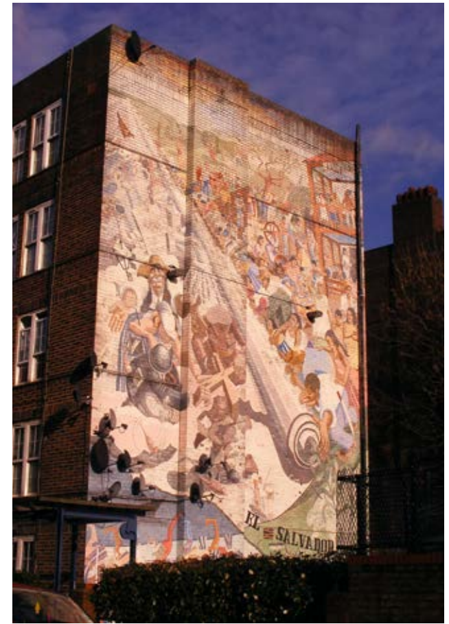
1985 'Changing the Picture' shows the people of EL Salvador rolling scenes of war away under a new image of peace. This mural was commissioned by the Cultural Commission of El Salvador Solidarity Campaign.

art.tfl.gov.uk Twitter: @aotulondon Instagram: @artontheunderground