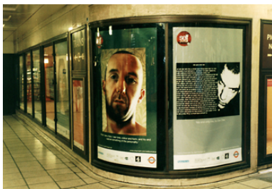
Self Portrait UK Piccadilly Circus station 05 May 2003 to 07 July 2003

The best short-listed entries of BBC London's photography competition, 24-Hour City, exhibited at Piccadilly Circus Station whilst the full list of entrants was exhibited at the London Transport Museum.