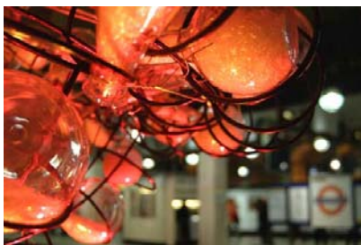
New London Glass

The first ever public exhibition on a London Underground Tube train showing the work of 42 artists from the UK and world-wide within all six carriages of one Piccadilly line Tube train. Sponsored by Bloomberg.