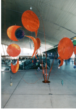
Ali Pretty Stratford Underground station