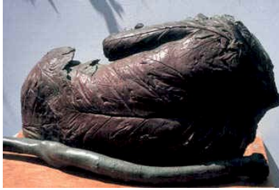
Stephen Duncan Gloucester Road Underground station