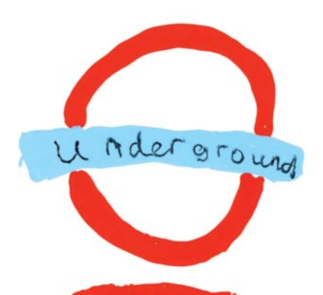
Drawing by a young person at Laburnum Boat Club