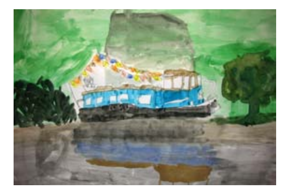
Watercolour paintings by pupils at Lauriston Primary School.